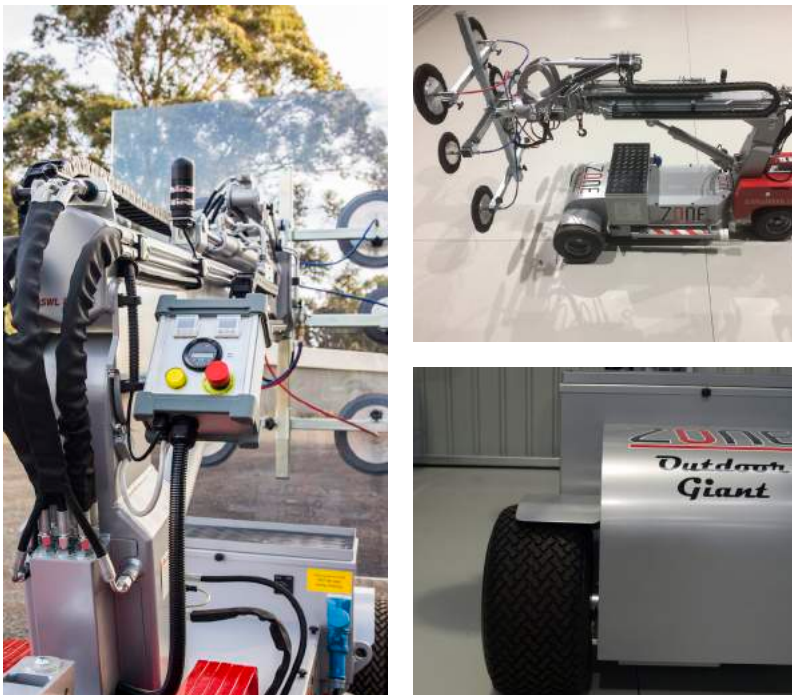
Automated load safety system with audible and visual alarm