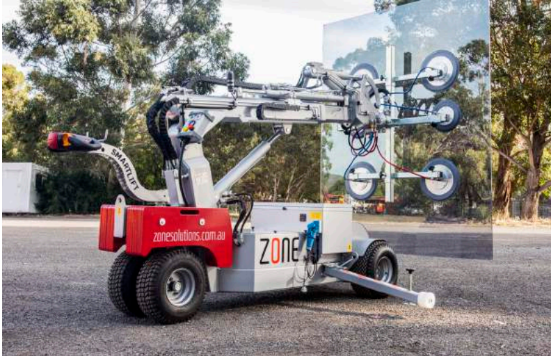
The SL 780 Outdoor Giant handles almost a tonne.